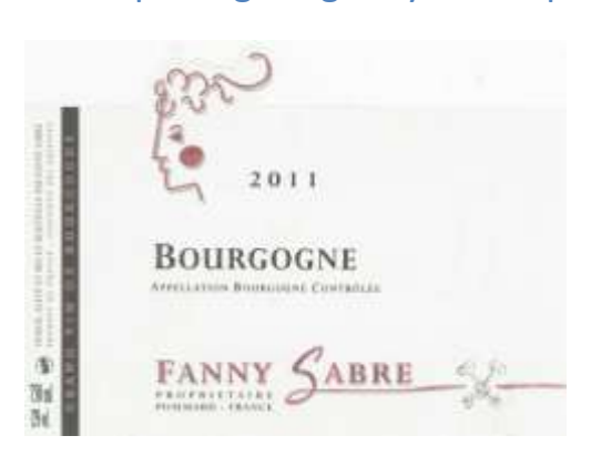
Pack 3: Exploring Burgundy reds 6 pack

This six pack has been put together to give you an insight into the varied styles of Pinot Noir that are available from this great wine producing region. Our preference is for light, elegant wines that express where they come from rather over-extracted heavier styles. All of these are entry level wines at an exceptionally reasonable price for wines from this region.