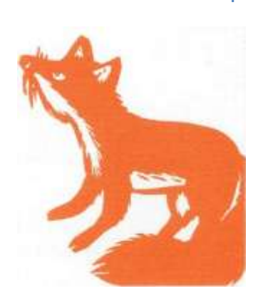
Pack 2: Bornard Jura 6 pack

The 'fox' has become one of the most widely recognised wine labels in the natural wine movement. Philippe Bornard produces fabulous white, red and yellow wines in the village of Pupillin in the heart of the Jura. This six pack has been designed to allow you to sample a range of his wine styles (he produces 18 different wines)!