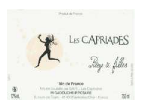
Pack 5: Summer sparkling wines 6 pack

This 6 pack is for the summer sparkling wines that we have repeated this month due to its popularity last month.