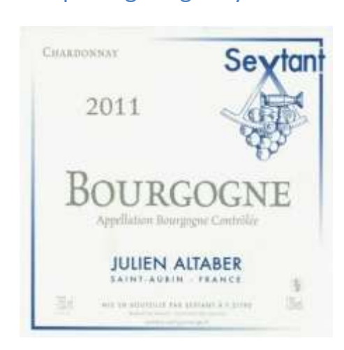
Pack 4: Exploring Burgundy whites 6 Pack

This six pack has been put together to give you an insight into the varied styles of Chardonnay that are available from this great wine producing region. Of course Burgundy whites don't have to be made from Chardonnay as Aligoté is a grape that produces great Burgundy wines as are Pinot Blanc and Melon de Bourgogne. But these are all 100% Chardonnay.