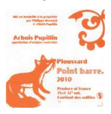
Pack 3: Calming reds – 6 bottle Pack

You have had a bad day at work and you arrive home wanting solace. What better than a red wine that isn't so big that it attacks your palate but rather a low tannin wine than calms you, soothes you and packs wonderful flavour! This is the six pack that we would wish for on those occasions.