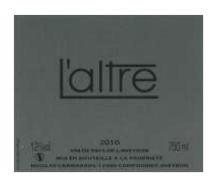
Pack 4: Delicious new arrivals 6 pack

This is a small selection of the new arrivals that we are very excited about. This selection represents a very diverse range of French appellations from the Jura in the far eastern side of France to the Fiefs Vendéens on the Atlantic west coast. Then from Burgundy in the north(ish) to the Aveyron in the central region. There are three reds and three whites.