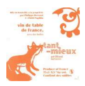
Pack 2: Méthode Ancestrale (Pet Nat) 6 Pack

This pack allows you to explore the delights of natural Méthode Ancestrale wines. There is a full article on how these wines are made in this newsletter. Each of the wines is sealed with a crown seal. These are all very low alcohol wines that are perfect aperitifs and perfect any-time-day drinking. They are completely natural and there is no added sulphur because the carbon dioxide is a natural preservative.