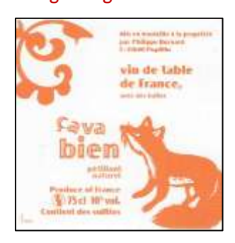
Sparkling Savagnin from the Jura

Ça va bien is a sparkling wine made using the Méthode Ancestrale process (see article below) from the Savagnin grape variety. It is a clear, golden colour and comes in a clear bottle closed with a crown seal. Because the fermentation finishes in the bottle there is some residual sugar (but not very much) and the alcohol content is low (10%).