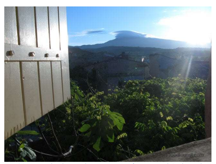
Sun rising over cloud capped Mont Ventoux from Caromb in the early morning

We have trolled our picture library and extracted some shots of a drive we did to the summit in April of this year and some shots from the terrace of our house showing the white-clad pinnacle in the distance. This is the view we see every morning as we enjoy freshly-baked baguettes for breakfast and every evening as we relax with a glass of Ventoux wine on the terrace such as our Chateau Unang rosé .