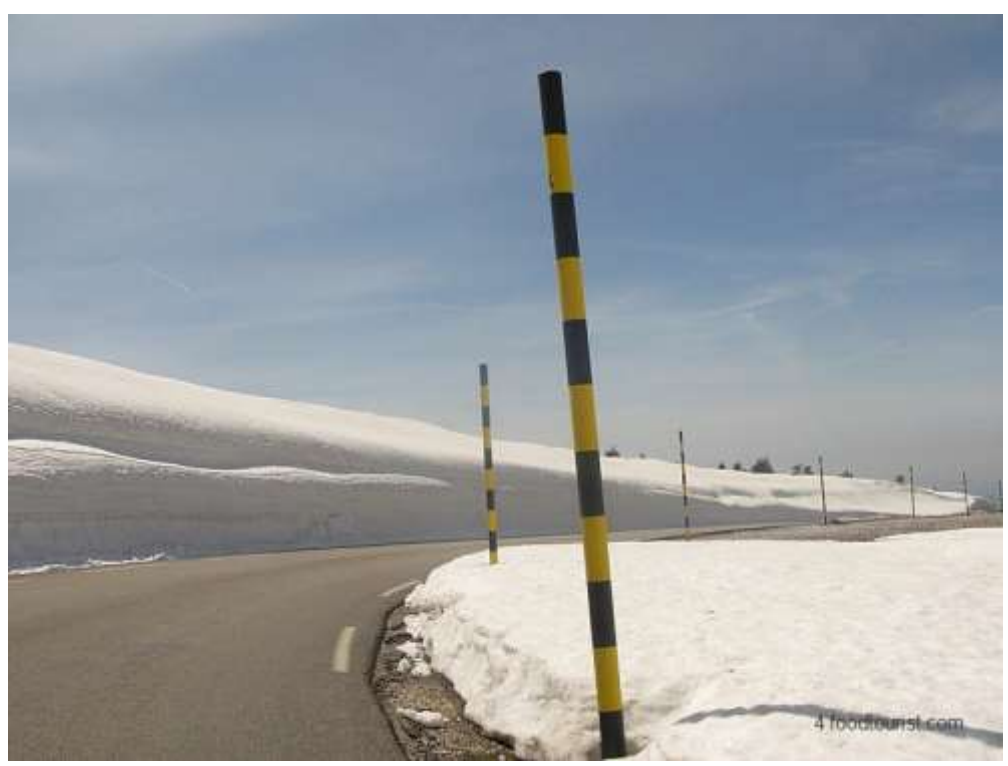
Snow near the summit – even in April