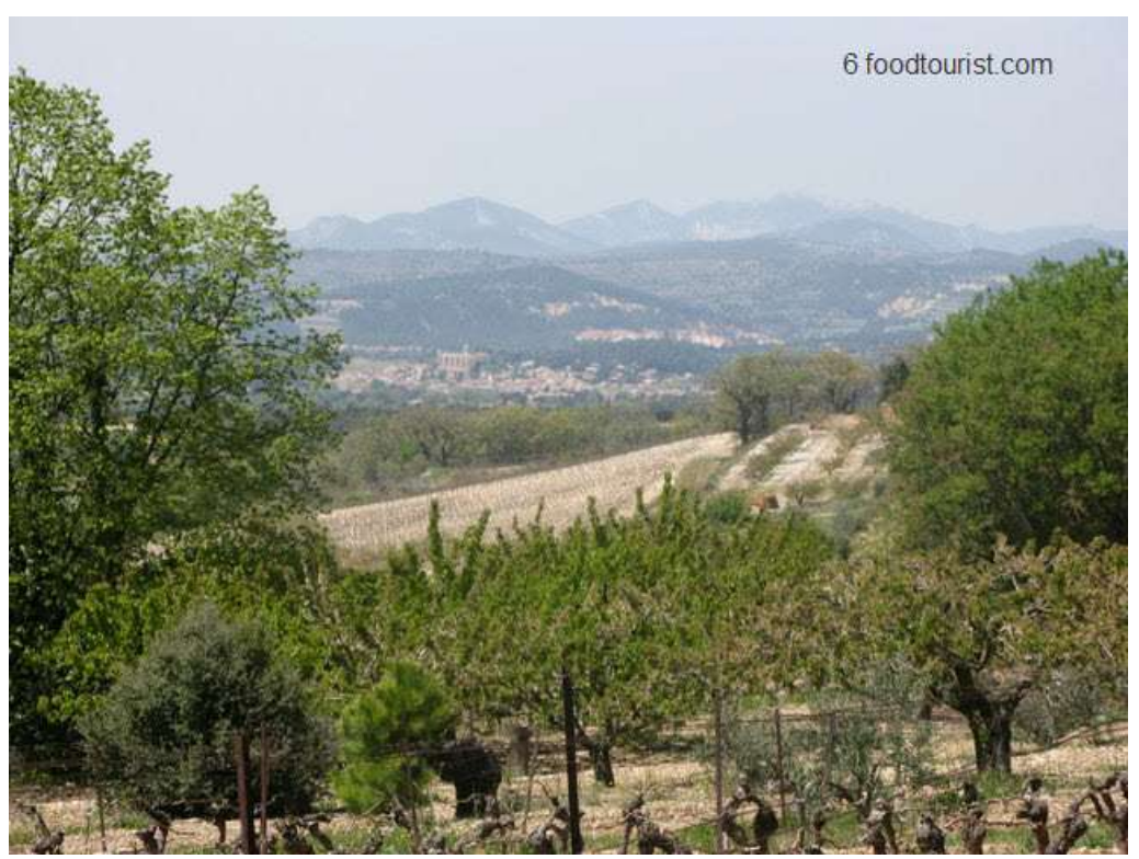
Vines on the lower slopes of Mont Ventoux looking towards Bedoin