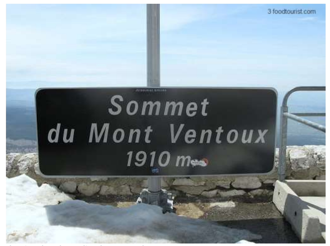
The sign that the cyclists love to see!