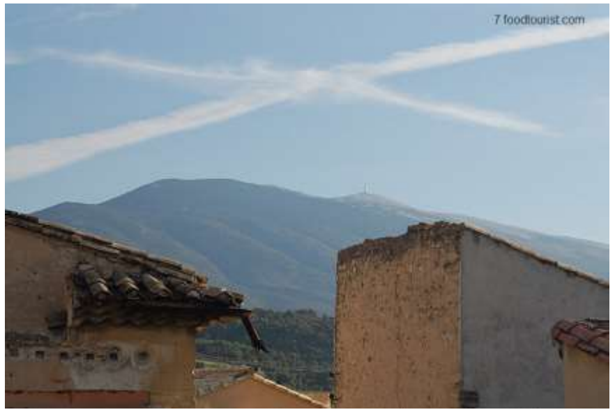
Mont Ventoux from our terrace in Caromb