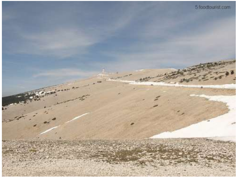
The final stretch to the summit with snow and limestone intermingled