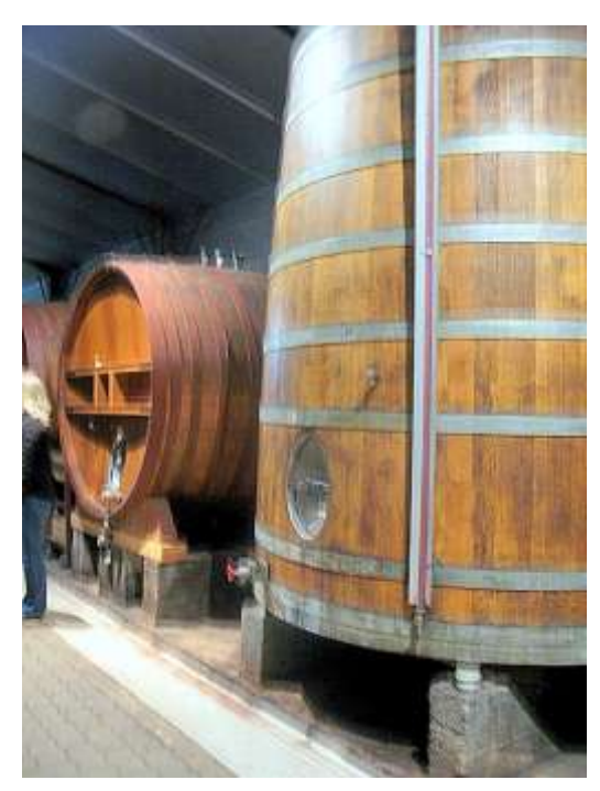
Ancient vats at Domaine Saint Nicolas - no new oak taste from these beauties!