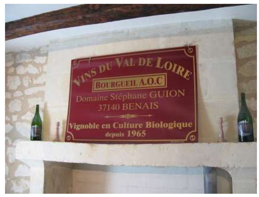
Guion has been organic since 1965