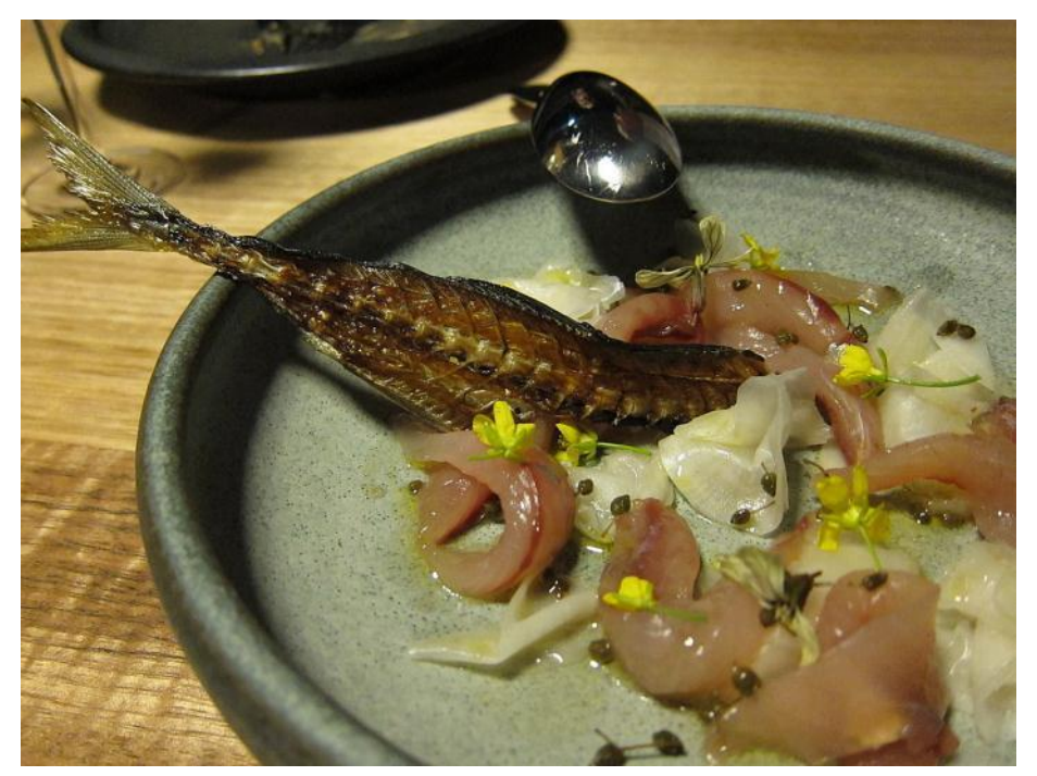
Crisp jack mackerel skeleton with raw jack mackerel with pickled elderberry and heirloom turnip