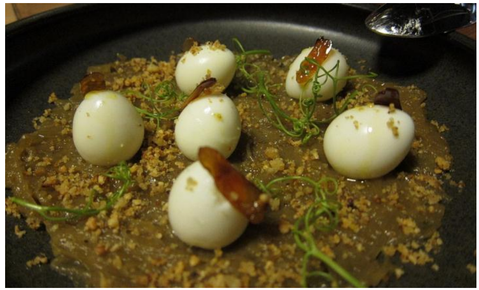
Quails' eggs with soft onions, almond picada and preserved spotty trevally roe