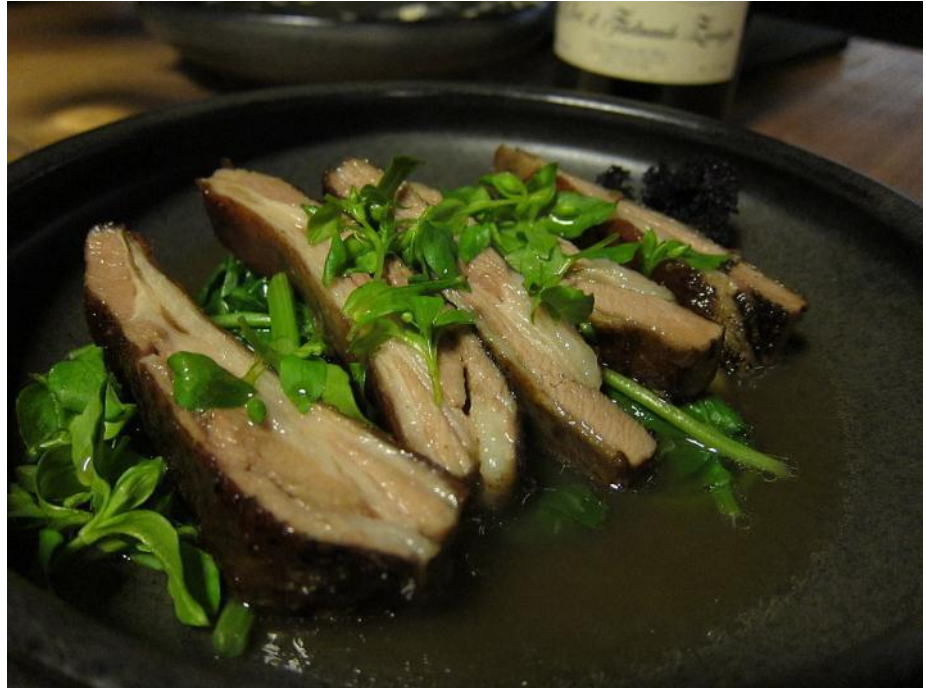
Braised lamb breast with broth, brassica leaves, kohlrabi, and chickweed