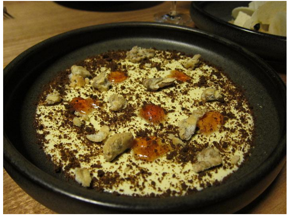
Silk oolong cream, quince jelly, rose hip puree, gingerbread and salted walnuts

We wish Luke, Kirk and Katrina all the best with their new venture and encourage anyone in Hobart or visiting Hobart to visit and check it out for themselves. In the meantime, if you want to see the wine list, visit their website <u>www.garagistes.com.au</u> and if you'd like to see more photos, we've posted all the dishes from the first night and the first Sunday lunch via our twitter account <u>http://twitpic.com/2mihtb</u>